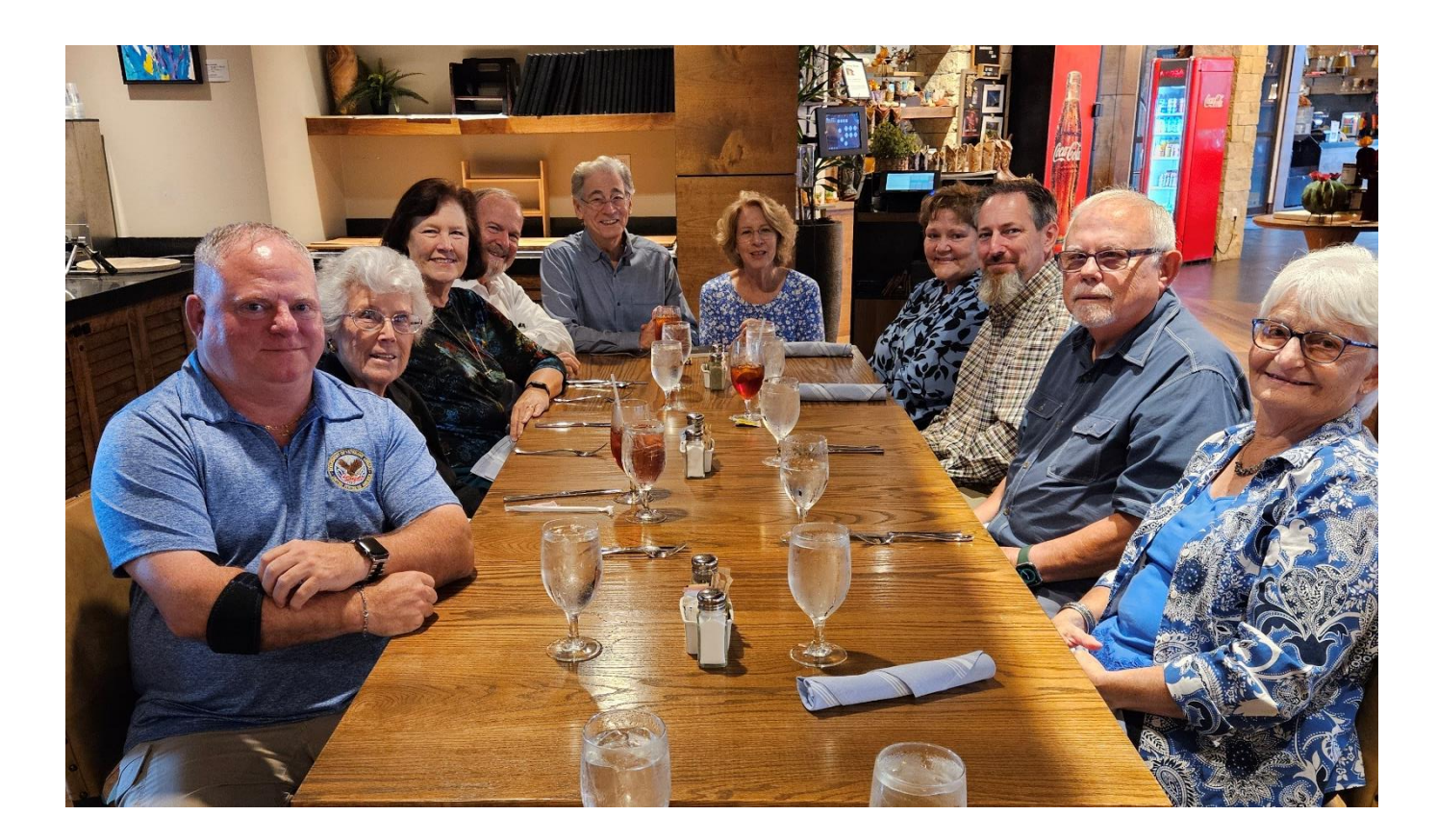
TABLE FELLOWSHIP IS AVAILABLE EACH SUNDAY AFTER CHURCH SUNDAY

We are all familiar with Lunch Bunch which meets on the first Monday of the month at Sauced. There is now another opportunity to share a meal and get to know one another beyond passing of the peace.